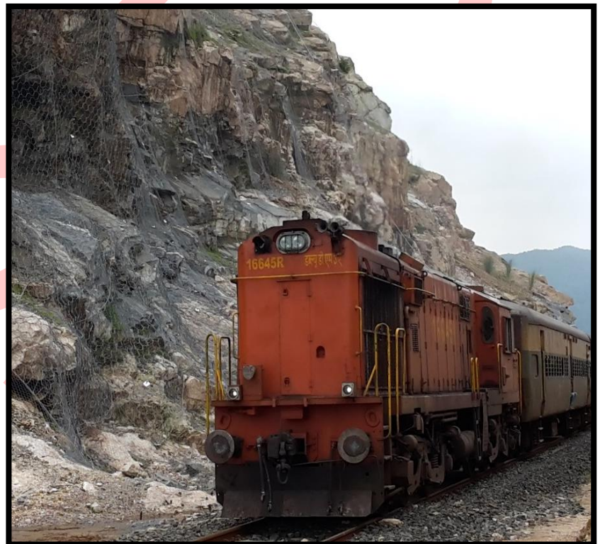
Figure 5 After Installation Finish

Slope surface has been prepared before the installation of GPS H panels. Loose and unstable rock particles which could detach easily from the slope surface has been removed. The GPS H panels were hauled to the top of the slope with the help of an electric winch placed at the top of the slope. The top row of anchors has been installed initially then primary net was installed. After that we spread the GPS-H mesh to the surface then starting the surface anchoring finally we have to do the bottom anchoring to protect the slope. Total protection area is 10,000 sqm (approximate).