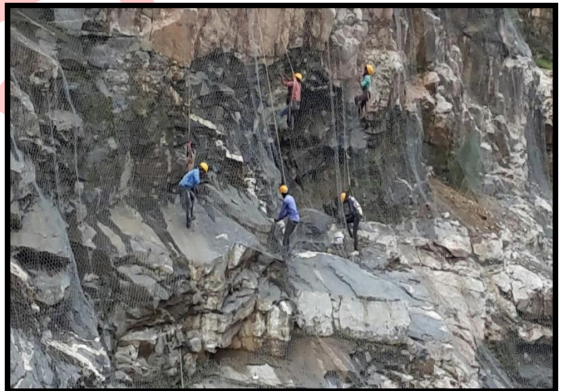
Figure 3 During Installation

OST suggested high tensile Ring net and small aperture size double twisted hexagonal mesh as a secondary mesh. During rain the huge pore water pressure may develop along the joint planes and also the mineral intake water to swell up maximum to change his soil properties drastically to fail the slope. Chance of planer failure