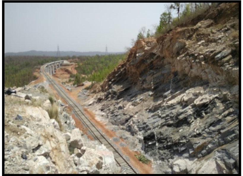
Figure 2 Initial Condition

To construct new Railway line cutting has been done in Lukuia hilly terrain. Same times the cut slopes are almost vertical to trigger the risk of sudden rock fall on the track. During investigation it was found that the chances of shooting stones and large scale rock block